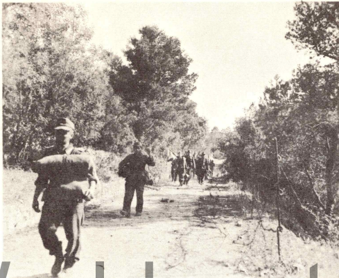
German prisoners coming in from an outpost to surrender to the 36th . . . D-Day in Southern France.