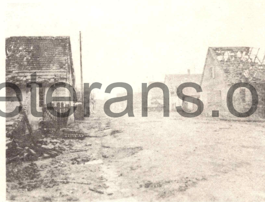
Bomb and shell-torn street in the town of Oberhoffen, Germany.