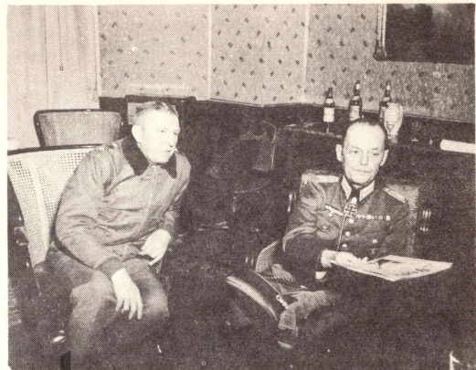
Field Marshal Gerd von Runstedt, the Dean of Junker Generals, is shown with his captor, Major-General John E. Dahlquist after his capture at Bad Tolz, Germany.