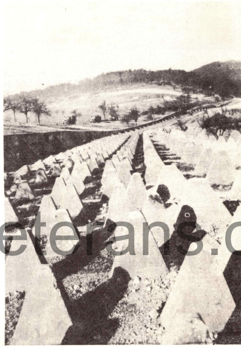
Dragon's teeth of the outer barriers of the Siegfried line.