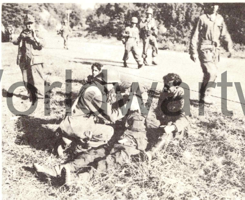
An officer treating a wounded German prisoner immediately after his capture.