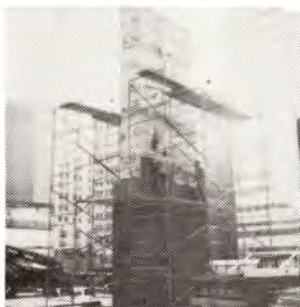
Monument during removal

The 45th Infantry Division Monument in Civic Center Park in downtown Oklahoma City, is now removed, and will remain in storage for about two years while the area is being developed into an office mall.