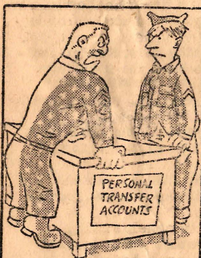
"You can send home all the money you want. But we do not say 'love and kisses to tookums' with it!"

Oct 5--United Nations' preparatory committee in London has voted that the permanent seat of the organization will be in the U.S. The vote was 9 to 3. No special site has been announced for the seat but informed sources say San Francisco and Philadelphia are in the running, with San