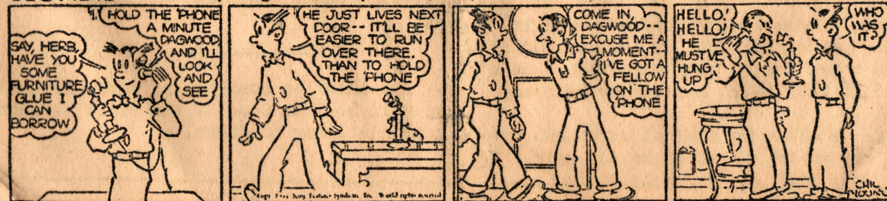
BLONDIE by CHIC YOUNG

Moscow radio reported that the Red Army had killed more than 20,000 Germans and destroyed more than six hundred tanks in repelling German counter-attacks in a 13-day battle near Lake Balaton, Budapest.