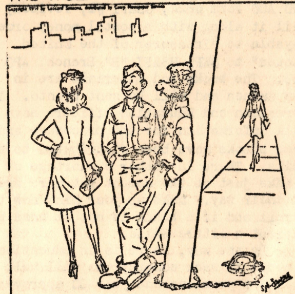
"His girl will be along any minute!"