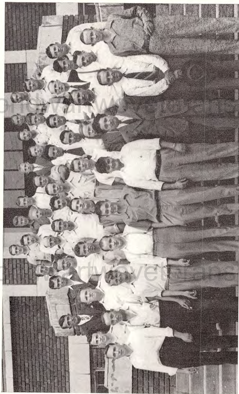
Group of Monongalia County Selectees and Volunteers