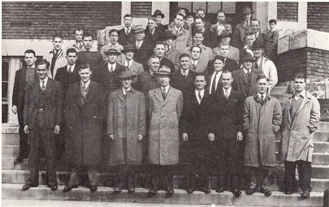
Group of Monongalia County Selectees and Volunteers