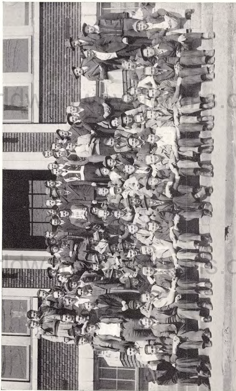
Group of Monongalia County Selectees and Volunteers