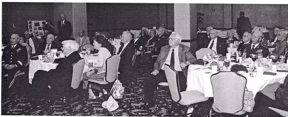
Members listening to our Guest Speaker