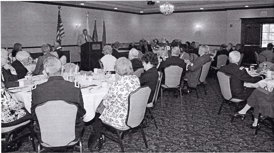
Members listening to our Guest Speaker